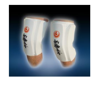
Product ID: KG Shinkyokushinkai Low Kick Protector