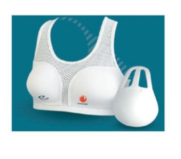
Product ID: CGS Chest Guard for Women (white)