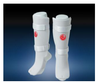
Product ID: LSB Shinkyokushinkai Leg Protector (Velcro Type)