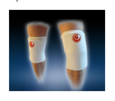
Product ID: KS Shinkyokushinkai Knee Protector