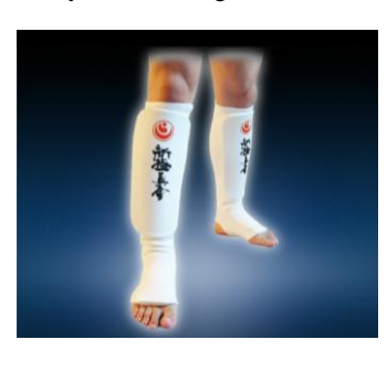
Product ID: LS Shinkyokushinkai Leg Protector