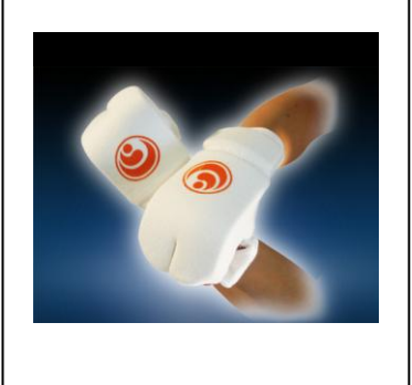
Product ID: NS Shinkyokushinkai Fist Protector