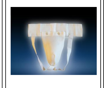
Product ID: FC Foul Cup (white)