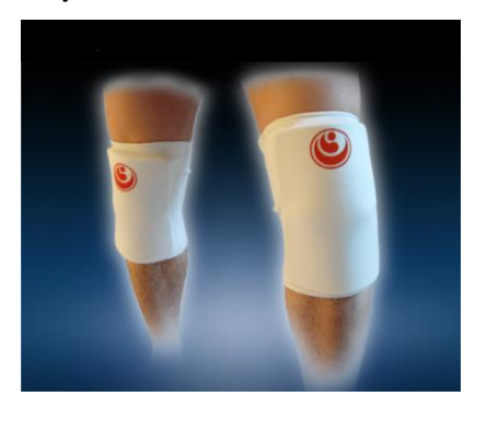
Product ID: KS Shinkyokushinkai Knee Protector