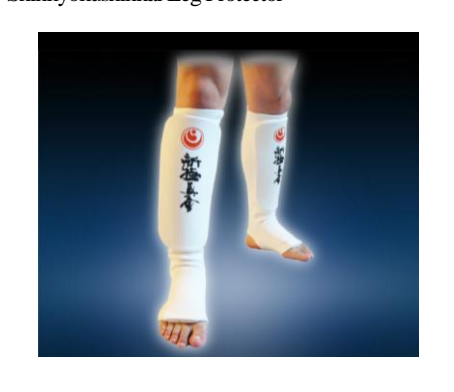
Product ID: LS Shinkyokushinkai Leg Protector