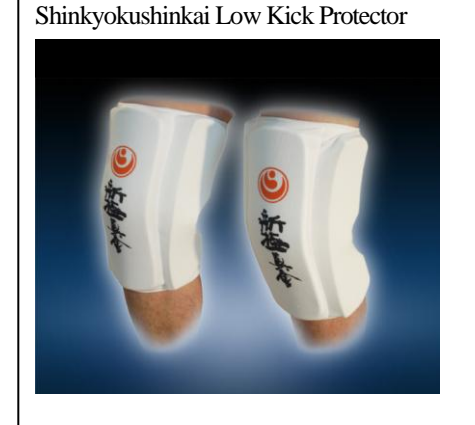
Product ID: KG