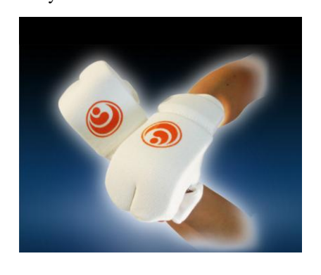
Product ID: NS Shinkyokushinkai Fist Protector