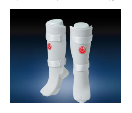
Product ID: LSB Shinkyokushinkai Leg Protector (Velcro Type)