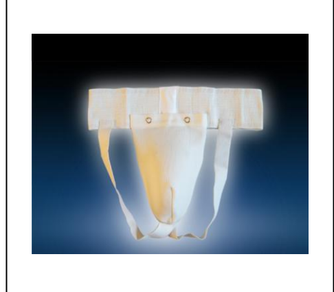
Product ID: FC Foul Cup (white)