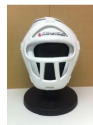
Plastic Face Guard