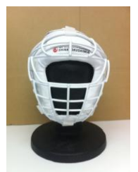
Wire Mesh Face Guard